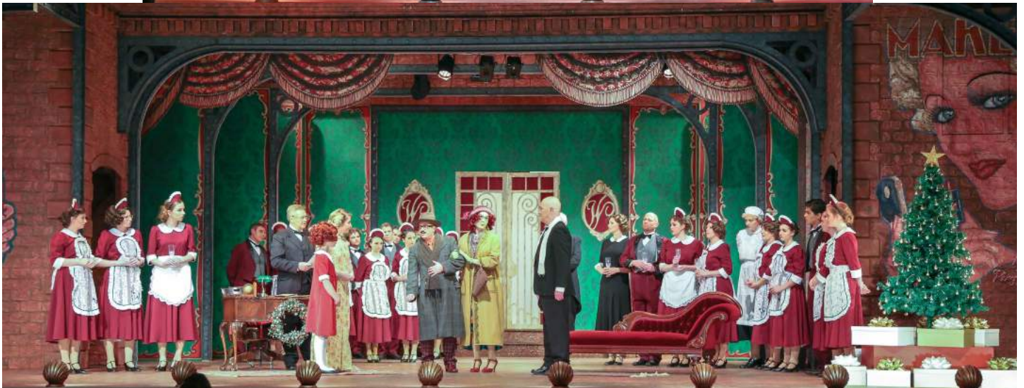
July Production of 'Annie'