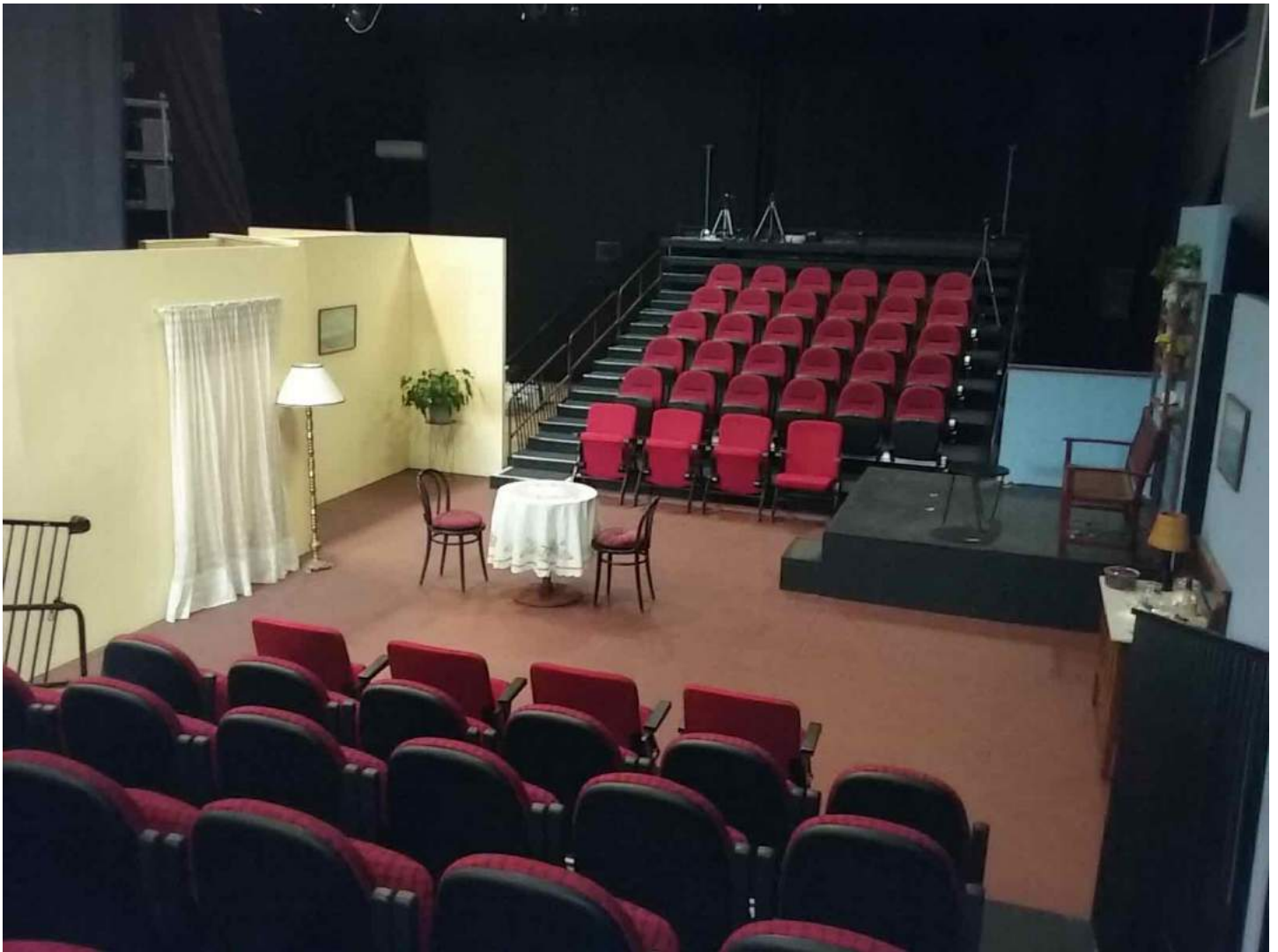
Traverse stage for "Death and the Maiden"