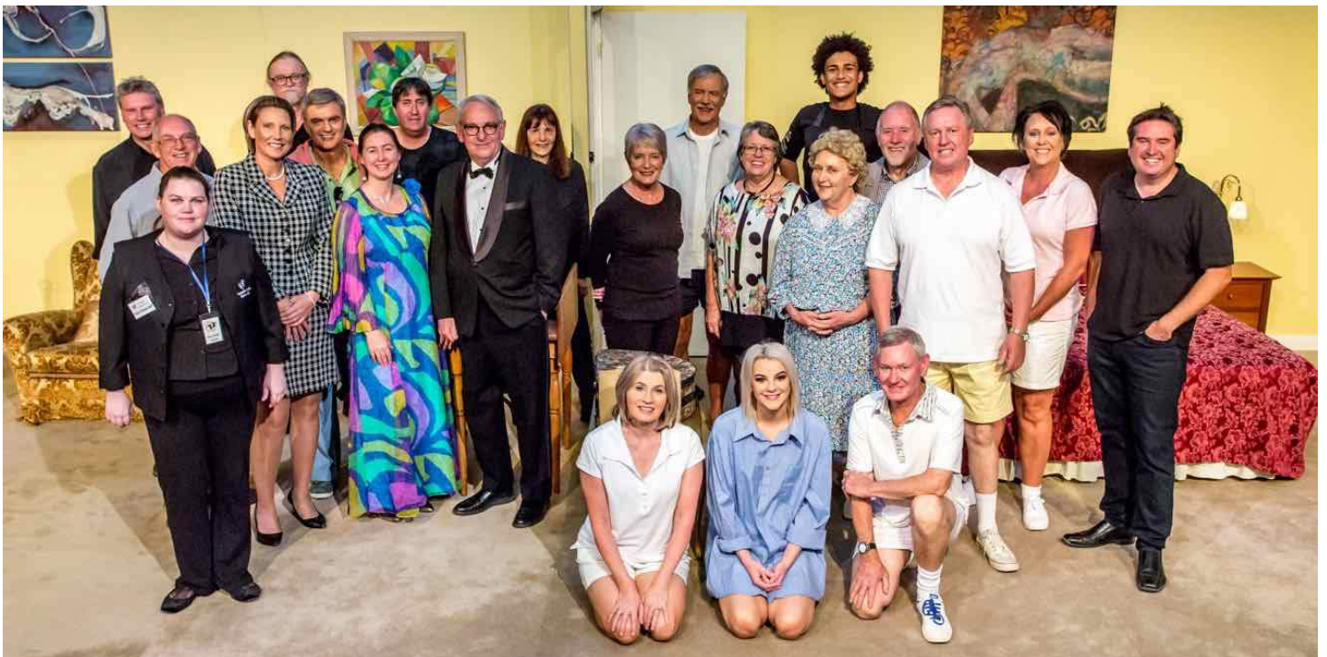
Cast and Production Team of 'California Suite'

Facebook- https://www.facebook.com/LyricLeongatha