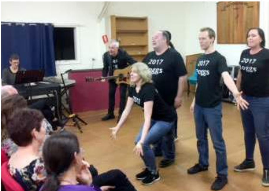
Boggs is Back AGM Preview