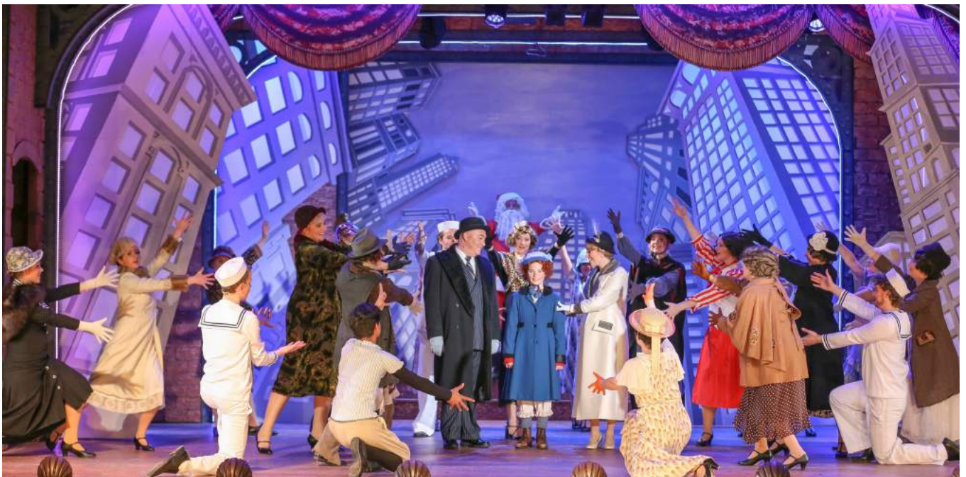
2018 Major Production 'Annie'